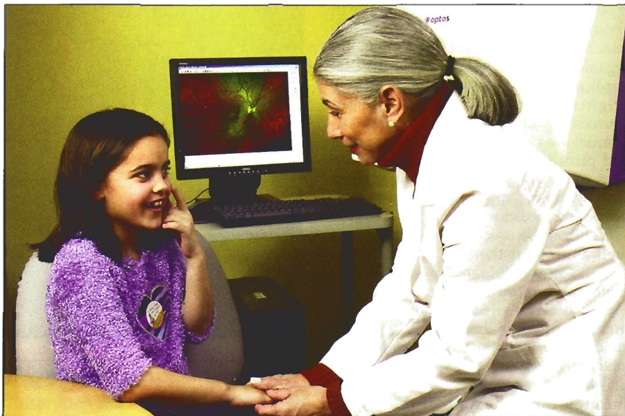
A physician and her patient use the Optos instrument which captures a digital image of ~80% of the eye, enabling early detection of disease.

Anderson founded Optos in 1992 and in 1999 the Panoramic200 Scanning Laser Ophthalmoscope (P200) received FDA 510k clearance, so that it could be sold in the United States, and full CE marking, which allows sales in the European market. The P200 captures a detailed digital image of up to 200 degrees, or approximately 80% of the eye, in under a second. Conventional imaging techniques acquire images of only ~5% of the eye. The ability to image such a large angular area allows